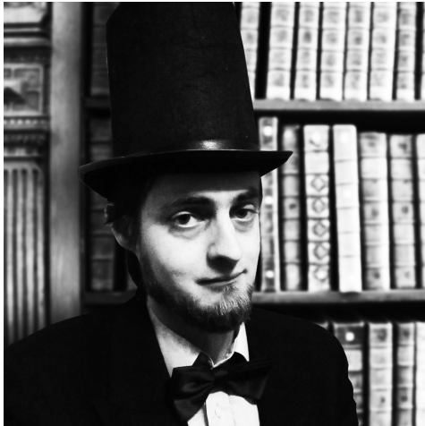
Former Deadwood resident now President of a United America?

The paper has dispatched a reporter to gather more details about this new religion which promises wealth and happiness for all in return for accepting the blessings of the 'Master'.